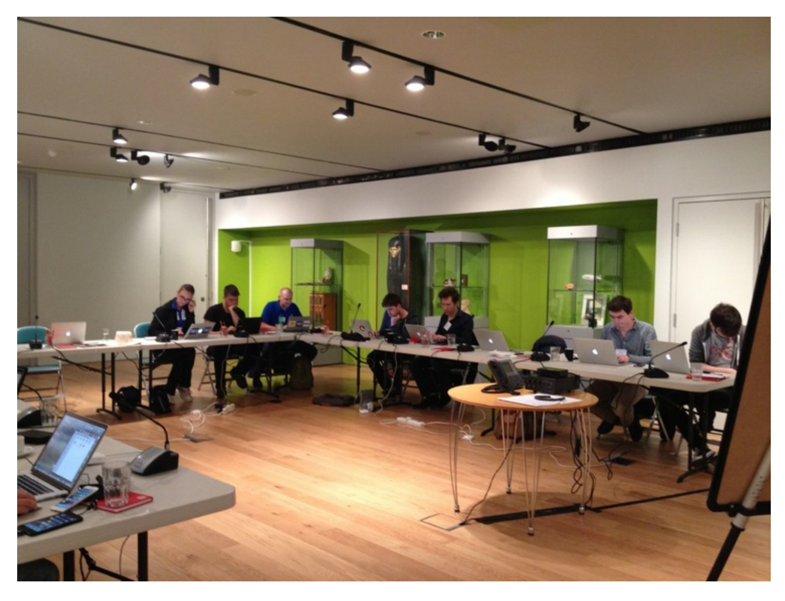
The interoperability test event at <u>The Higgins</u>, with attendent Sarcophagus